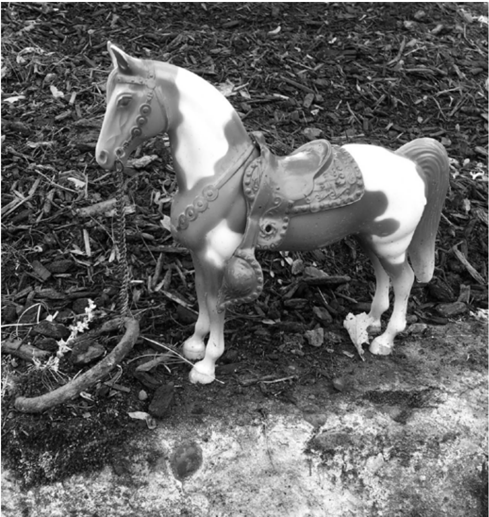
In days of yore, iron rings kept horses and their wagons in place while deliveries were made to your door. Nowadays, you’ll see toy horses hitched to some of those remaining rings.