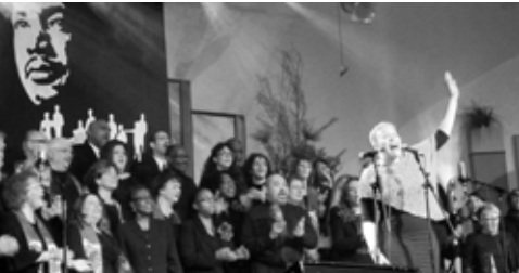
Portland Interfaith Gospel Choir

Summer has arrived and, with it, the Fernhill Concert Series and National Night Out. Pack your blanket, picnic basket, the kids and the dog. Head for Fernhill Park Friday, July 6 and return the following four Fridays. That final Friday, Aug. 3, celebrates National Night Out with a concert and a movie. Children’s activities are part of the evening’s fare and free popcorn is available during the movie. Each Friday’s activities are on the west side of Fernhill Park, beginning at 6:30 p.m. Food vendors are available. The concerts are among 61 this summer in 42 Portland parks, and this is the second Year Concordia Neighborhood Association (CNA) has screened a