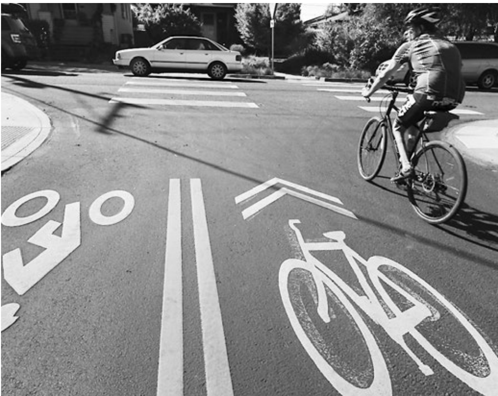
Are you a bicyclist who wants to brush up on Oregon law re: taking the lane, riding on sidewalks, signaling, lighting, e-bikes, riding under the influence and more? This clinic may be for you.