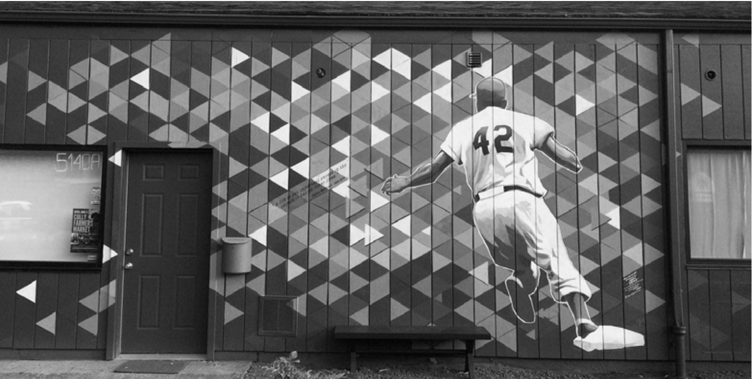
Jackie Robinson – even his player number, 42 – has plenty in common with Our 42nd Avenue. The organization’s primary goal is to support equity and inclusion of all who live, work, play and do business in Cully and along 42nd Avenue.