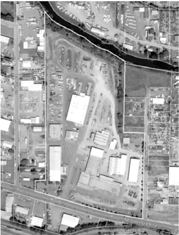
TriMet is planning a new bus operations facility on this five-acre site on the north side of Columbia Boulevard. It's just east of 42nd Avenue in the Cully neighborhood

route to the garage. "Locating a garage in northeast Portland, where TriMet has some of its most robust bus service, allows buses to begin and end their routes closer to their home bases," Altstadt explained. "This minimizes the time buses spend in traffic between the garage and the starts or ends of their service routes." TriMet's outreach team has been working to notify residents and business owners in the area. It has sent postcards to addresses within a one-half-mile of the Caterpillar site. What about an environmental impact from leaky buses or bulldozers? "Any potential cleanup is to be determined as we learn about the site condition," Altstadt said. "TriMet values sustainability and we will meet or exceed environmental standards." What about buses going through Concordia, particularly 33rd Avenue? "Traffic studies are underway to determine what improvements TriMet might make to adjacent streets and sidewalks," she explained. "It is likely that a traffic signal and pedestrian crossings will be added at northeast Columbia and northeast 42nd."