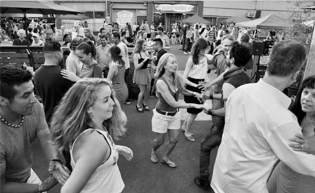
Dancing to live music is just one form of entertainment at Last Thursdays. This year's events are June 28, July 26 and Aug. 30.