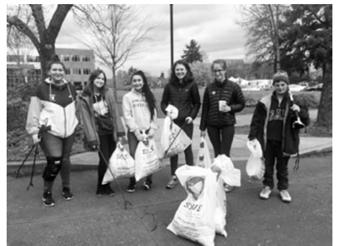
Concordia University Serves volunteers removed 700-pounds of trash from 120 blocks of Concordia alleys in April.

The collection bags were staged at the end of each of the 120 alley blocks for pick up by a van that followed the crews. A dumpster was provided by Concordia University.