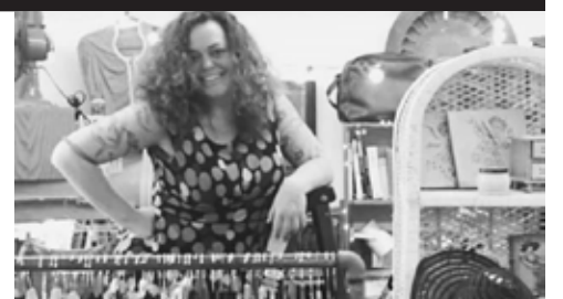
RESALE PRESERVES THE PAST Red Fox Vintage is an eclectic destination for vintage shopping.