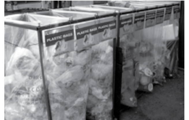
This is our customer recycling area at the Concordia New Seasons Market. There are signs with pictures to explain what items go where. If you have questions, we are happy to help.