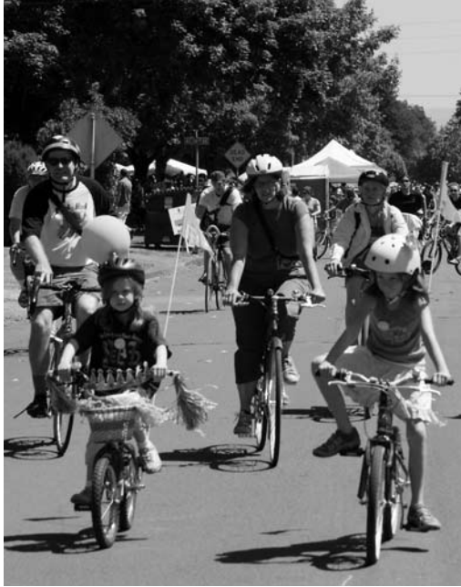
Thousands enjoyed the perfect weather and joined neighbors for Sunday Parkways.